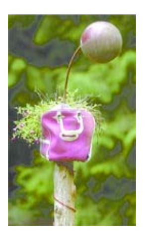
This zippy number is in need of a haircut. Next year — bowling for Columbine?