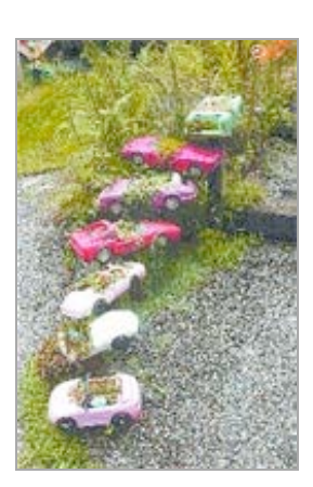
This seven-car pile-up stops traffic in the back

If appropriate is the word guiding most garden planting schemes, appropriation is Ranger's. Among the winding paths skis become slats for benches, a bowling bag a planter. Nothing is sacred, or maybe it all is. Anything — flippers, telephones, springs, toys — can find new life here. Funzilla, a gargantuan lighted assemblage of random objects, towers over