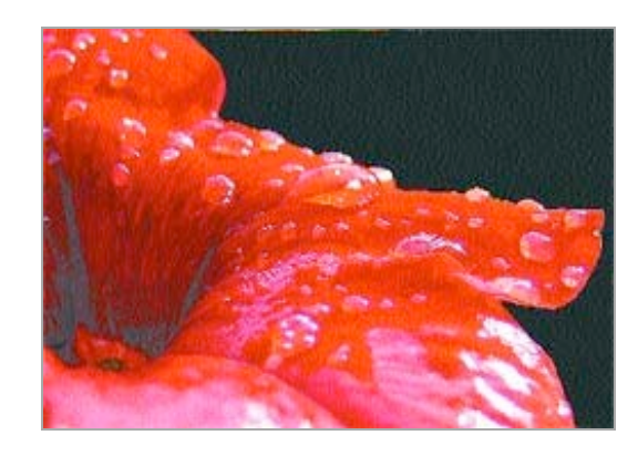
Belinda took up photography last fall. Her photos, such as this one entitled Rainstorm in Red, can be seen online here.