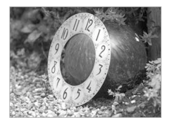
Must be time for bowling.