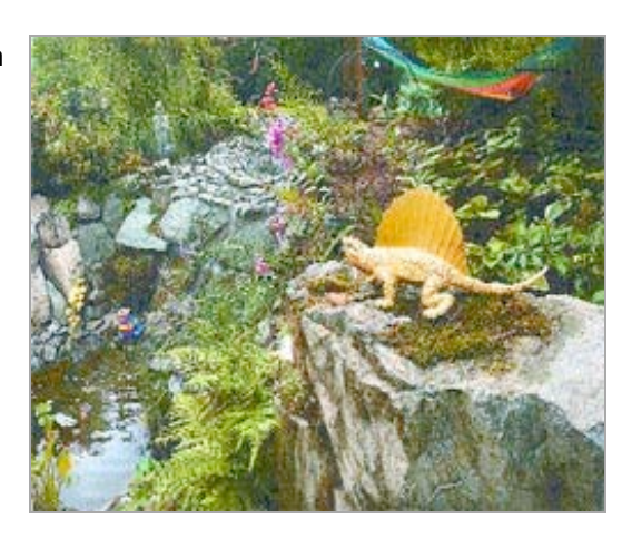
A spinosaurus contemplates taking the plunge. Belinda Chambers' sons built the rock pond last summer.