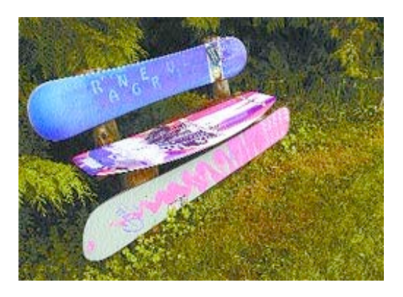
Snowboards find new purpose as an imaginative bench.

The installations are social events, too. An outdoor studio is stocked with paint, bric-a-brac, unfinished