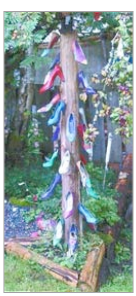
Word play, puns and pundits inspire garden art such as the exotic Shoe Tree.