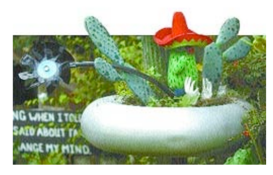
Can I have a show of hands? Who thinks planting a cactus in an innertube might lead to trouble?